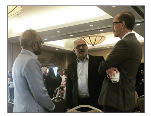
RESEARCH BULLETIN 2020 | 5