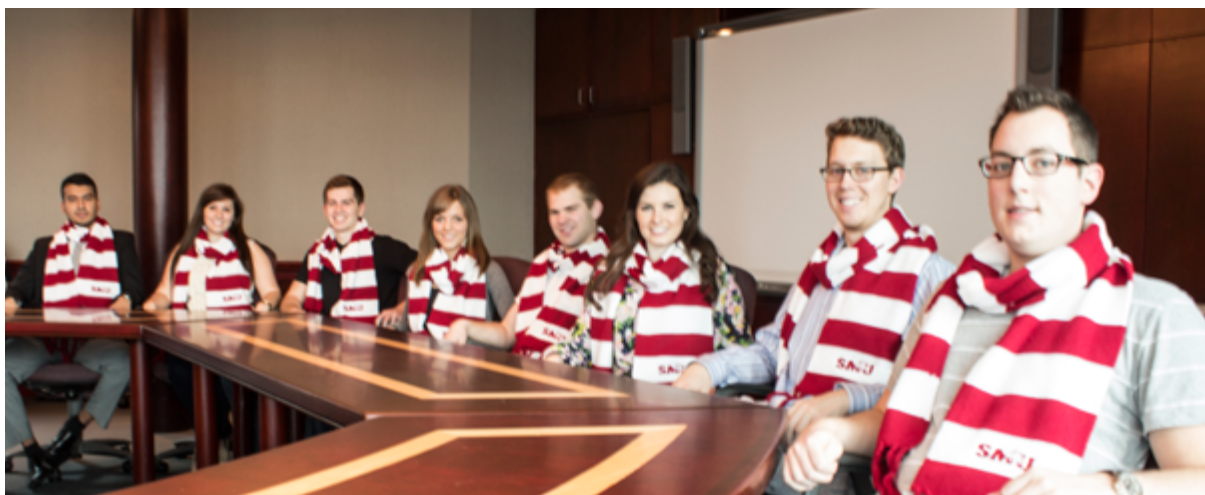
The ICBC team sport their Saint Mary's colours and Sobey School winning attitudes!