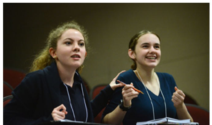
High school students learn the joys and heartbreak of stock trading at the High School Trading Competition hosted by the Sobey School IMPACT team.