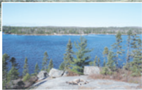
Top: The Saint Mary's BioBlitz team meets at Blue Mountain in the Blue Mountain – Birch Cove Lakes Wilderness Area.