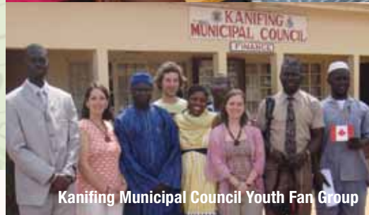
Kanifing Municipal Council Youth Fan Group